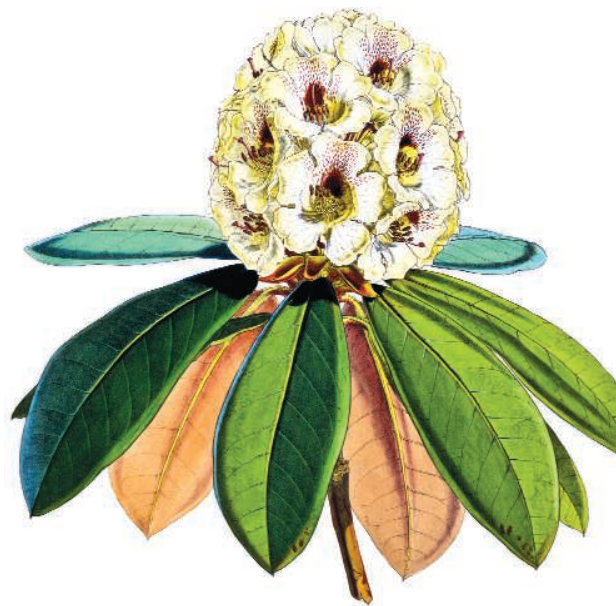
Fashion setter. Hooker’s Rhododendrons of Sikkim Himalaya (1849) led many British gardeners to grow the genus for its colorful blossoms.